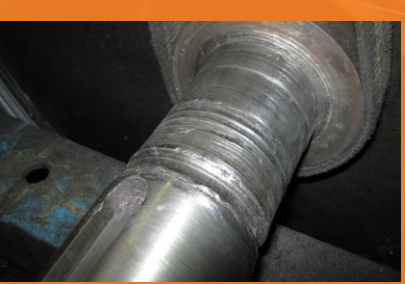
Wear and Corrosion 1 Damaged mechanical elements can lead to premature failure...