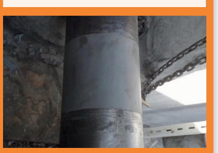
Shaft Restored In Situ 4 days of downtime avoided with a quick repair...