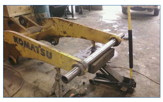
Dummy shaft installed to maintain alignment

steel substrate and the dummy shaft installed to ensure precise alignment. Repairs were completed for 1/10th the cost of welding and line boring, and the loader was returned to service the next day. The Belzona Technical Consultant was on site to provide training and supervise the repair carried out by the customer's maintenance crew. The client was pleased with the Belzona solution and continues to use Belzona materials for their maintenance needs.