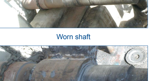
Belzona applied, former in place