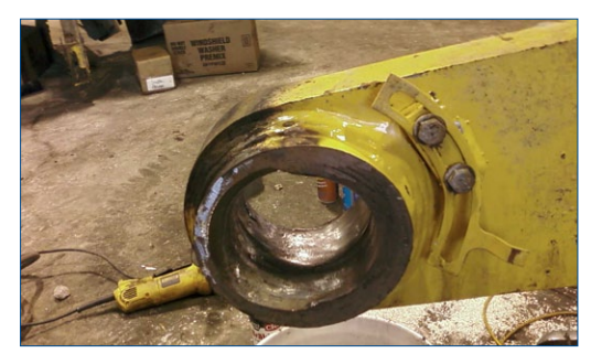
Damaged pin bush housing

Belzona offered a cost- and time-saving alternative to conventional repair methods at a metals recycling facility in Missouri, USA. Wear affected the pin bush housing on a Komatsu Loader leading to metal loss and misalignment. These bushings are located where loader arms connect to the loader body. Conventional welding repair would require the loader to be out of service for a long period of time. The Belzona solution was chosen for its ability to minimise downtime, while also providing a lasting solution.